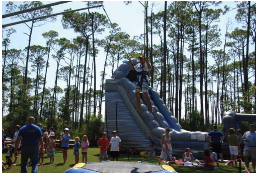
The Family Fun Event hosted by the College.