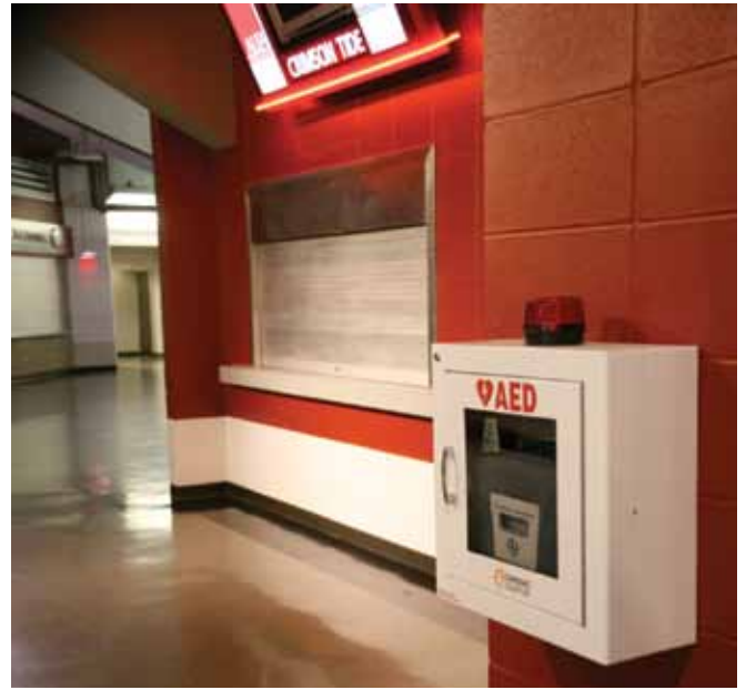
The University of Alabama's Coleman Coliseum has three Automated External Defibrillators, including this one by the main entrance.

A utomated External Defibrillators (AEDs) are being distributed to 75 high-traffic buildings on campus thanks to a combined gift from the College's Capstone Foundation and EMPACT West Alabama.