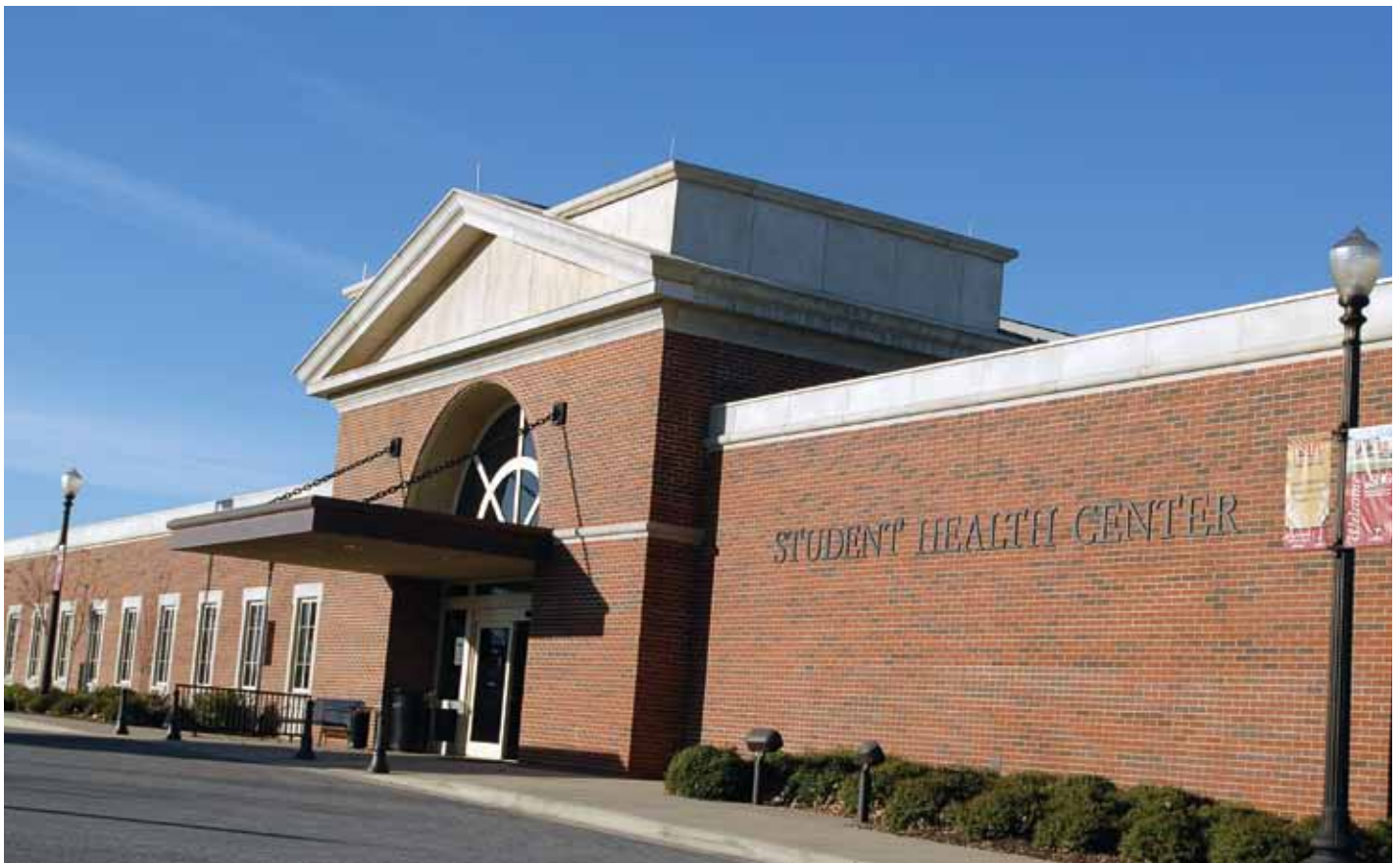
Student Health Center

Physician faculty at the Student Health Center conduct research and present papers at national medical conferences, keeping them up-to-date with current knowledge and medical practices in student health care.