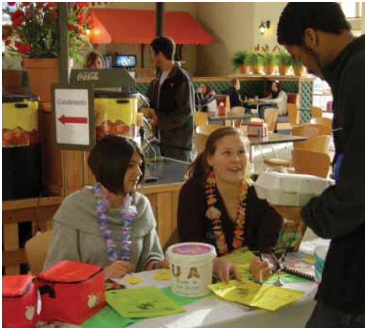
Dietetic students help other students choose healthy meals at Lakeside Dining Hall during an event sponsored by the Department of Health Promotion and Wellness.

In addition, the Department of Health Promotion and Wellness has developed special initiatives to heighten visibility of and attention to the top two health concerns facing U.S. college students – alcohol use and