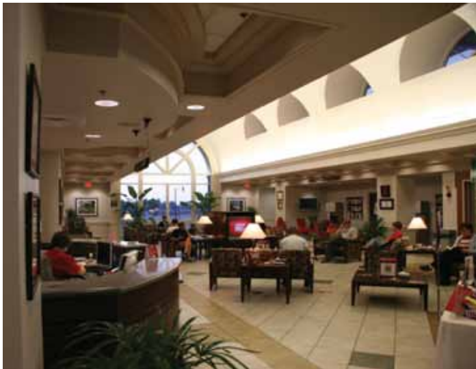
Student Health Center Lobby

The high quality of care provided by the Student Health Center has been recognized by the state, which awarded Alabama Quality Awards, its highest honors for quality and performance excellence, to the center in 2007 and again in 2009. The center received the Level 1 Commitment to Excellence Award in 2007 and the Level 2 Progress Toward Excellence Award in 2009.