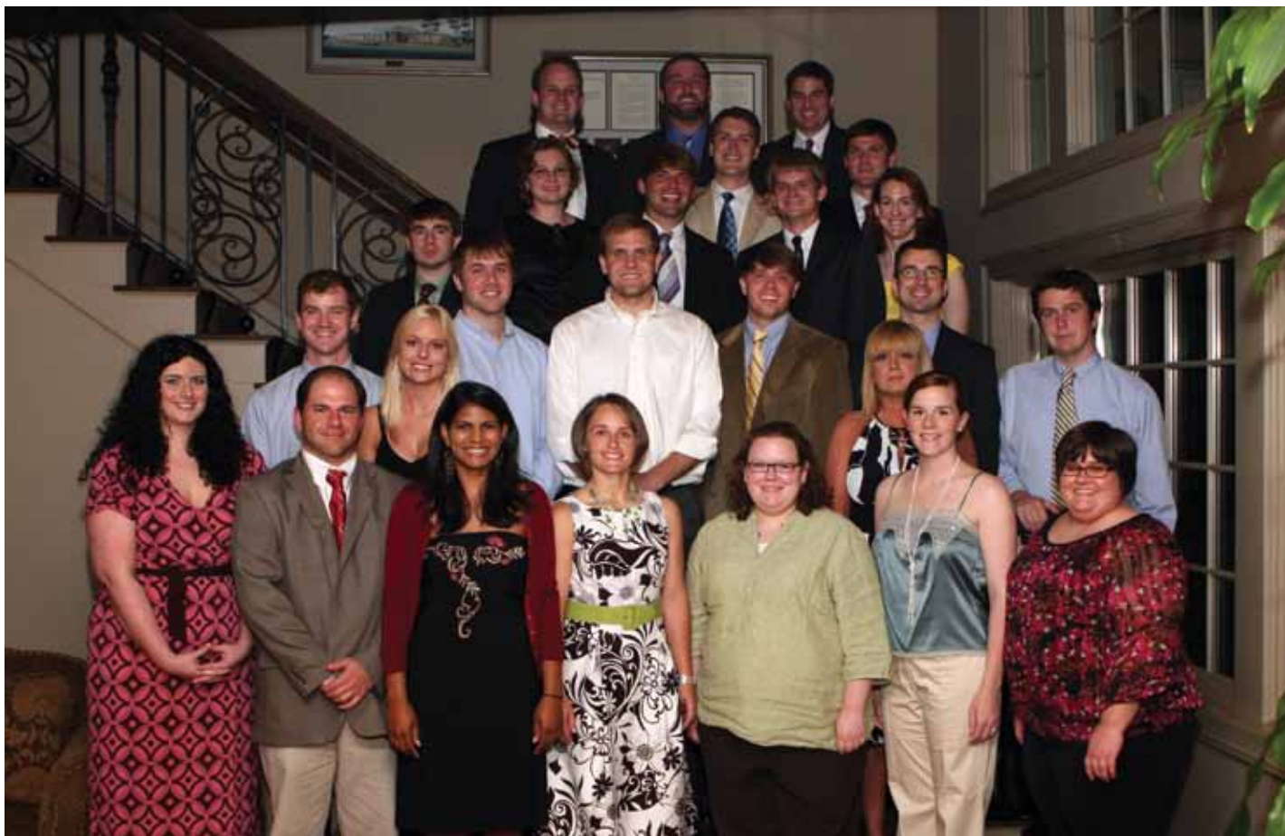
Medical students recognized at the Honors Convocation.